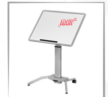
30" x 22.5" WHITEBOARD w/ METAL EDGE TOP