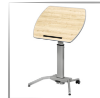
30" x 23" (MELAMINE) ELLIPSE TOP