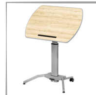
34" x 24" (HPL) ELLIPSE TOP