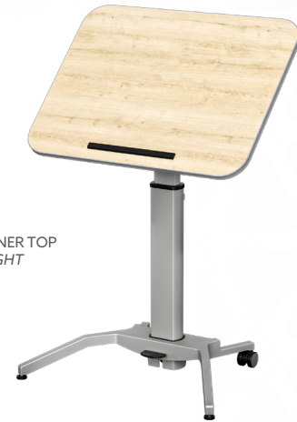
30" x 22" (HPL) ROUND CORNER TOP PICTURED RIGHT

Add'l. edgeband options are available including matching edgebands, contact a MiEN representative for more info.