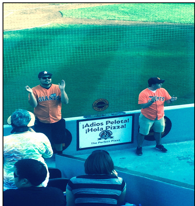
Doing the YMCA song.