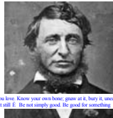
Do what you love. Know your own home: grow at it, bury it, unearth it, and grow it all. E. He not simply good, he good for something.